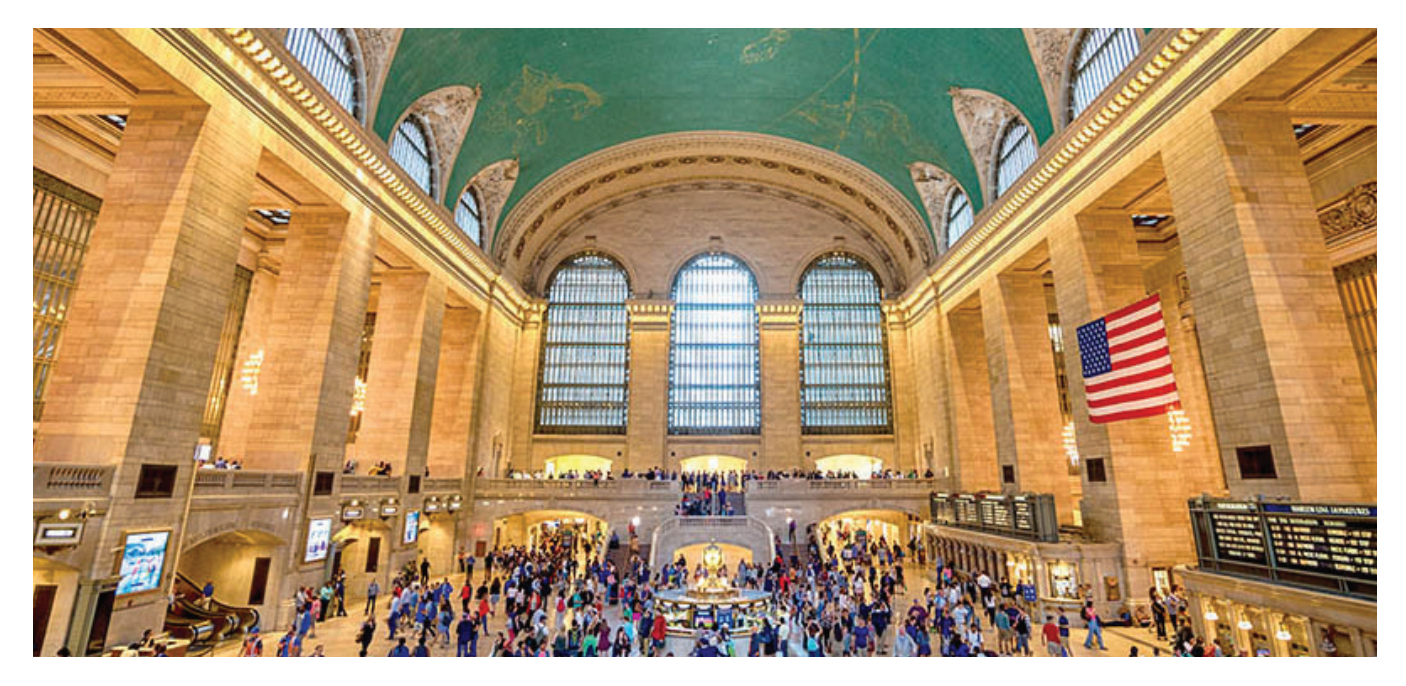
mild increase in activity.

The Federal Reserve ("Fed") kept interest rates steady at a 22-year high of 5.25% to 5.5% in December, while providing forecasts showing U.S. officials believe rates will end this year at 4.5% to 4.75%. Rates are expected to fall even lower in 2025, with official forecasts at between 3.5% and 3.75%. The Fed's projections triggered a rally in U.S. stocks and a sharp fall in Treasury yields.