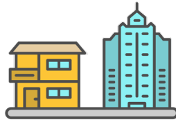
REAL ESTATE PROPERTIES Including apartments, condominiums, hotels, offices and shopping centers.