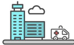
HEALTHCARE FACILITIES Including hospitals, healthcare centers and nursing homes.