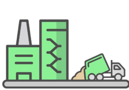
ENVIRONMENTAL FACILITIES Including landfills, recyclers and treatment plants.

This policy is suitable for many facilities, including: