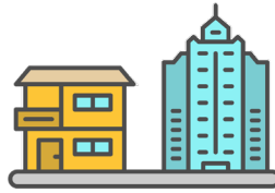
REAL ESTATE PROPERTIES Including apartments, condominiums, hotels, offices and shopping centers.