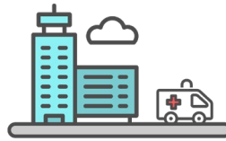
HEALTHCARE FACILITIES Including hospitals, healthcare centers and nursing homes.