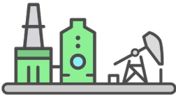
CHEMICAL/PETROLEUM FACILITIES Including distribution, manufacturing and storage facilities.