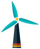
Alternative Energy Contractors

This policy is suitable for many contractors, including: